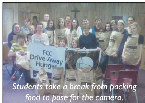
Students take a break from packing food to pose for the camera.